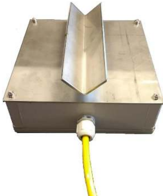
Example: light pole